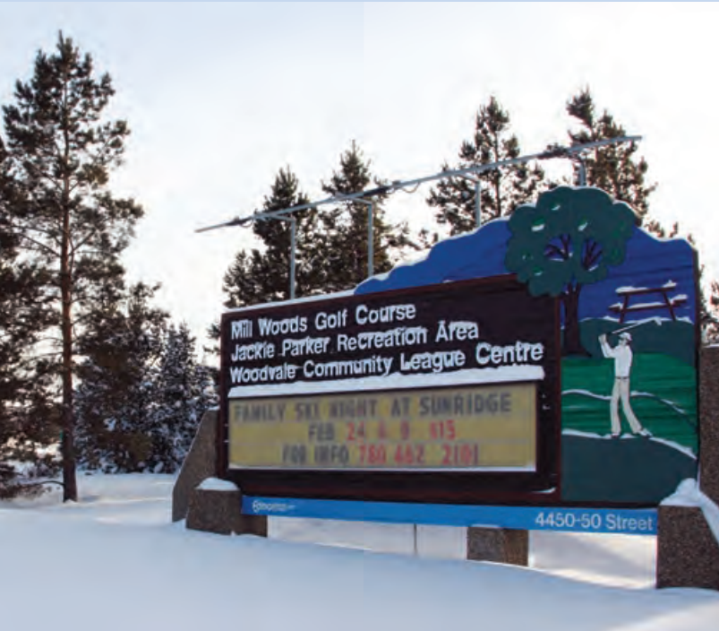
Millwoods Golf Course, Jackie Parker Recreation Area