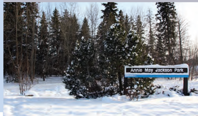
Annie May Jackson Park